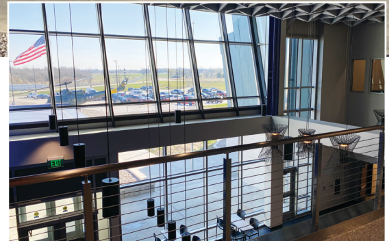
Two-story entrance atrium provides ample daylighting

P rost Builders recently completed the Missouri National Guard's new Theater Aviation Sustainment Maintenance Group (TASMG) Readiness Center in Springfield, Missouri. This new, two-story facility was designed for training, administrative, logistics, storage, and arms vaults required to achieve proficient training for members of the 1107th TASMG. The extensive glazing provides ample daylighting throughout the 43,000-square-foot structure. The project site was challenging due to the size of the facility and the limited site. The adjacent Aviation Classification and Repair Depot (AVCRAD) was also at full operation during construction. Our team was able to safely control the site and maximize the owner's ability to use the surrounding facilities throughout construction. This was achieved by close and open communication with the owner and our on-site personnel. Kevin Fahy was the project manager and Ken Warner served as superintendent on this $10 million project.