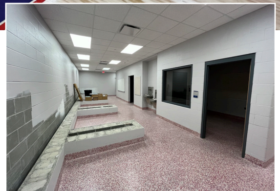
The new locker rooms are nearing completion.