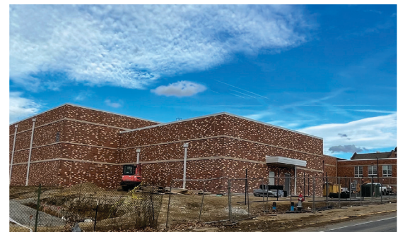
The exterior of the new gymnasium and locker rooms are complete with only site improvements to be completed.