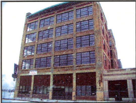
New Windows Under Construction

Design-Build Development General Contracting